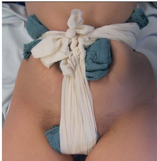
Fig. 2 Photograph of the applied “sumo-compression” in PPH.

“sumo-compression”. With both methods in our department post partum hysterectomy could nearly always be avoided. The ease of the method encourages the obstetrician to act without losing valuable time by hesitating to perform one of the more complicated procedures. Hopefully the “sumo-compression” will help to reduce maternal morbidity and mortality particularly in resource-poor settings.